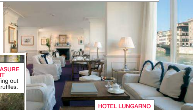
HOTEL LUNGARNO Cozy seating at the Picteau Lounge.