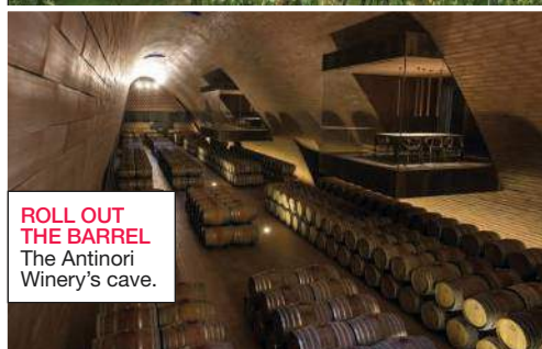
ROLL OUT THE BARREL The Antinori Winery's cave.