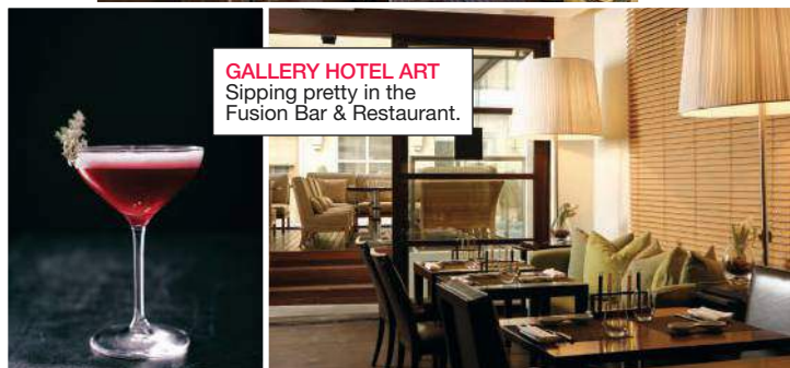
GALLERY HOTEL ART Sipping pretty in the Fusion Bar & Restaurant.

TRAVEL TIP: For 360-degree views of the city climb the 463 stone steps to the top of the Duomo or the 414 steps of the Campanile di Giotto. Reward yourselves with soul-satisfying gelatos afterward.